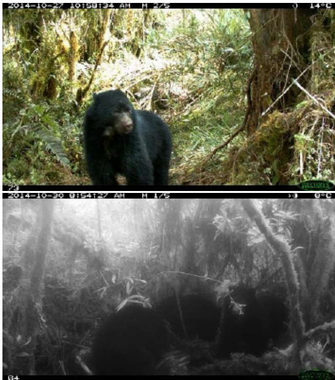
Figure 2. A) Individual Andean bear recorded on October 27, 2014 in Choachí municipality, Colombia. B) Group of Andean bears scavenging on a single carcass on October 30, 2014, at Choachí municipality, Chingaza National Natural Park, Colombia. From right to left the first individual was recorded feeding alone from the same carcass three days before.

On October 27, 2014 an individual was recorded scavenging on a cow carcass between 10:50 and 11:00 h in Chatasuga locality, Choachi municipality ( 4^{\circ} 35' 46.79'' N, -73^{\circ} 50' 42.85'' W; 3,187 masl); the individual was an adult, clearly identified by a small spot in the head and a long chest patch (Figure 2a). Three days after, the same individual was again photographed (October 30, 2014), but this time with two additional individuals, all scavenging simultaneously on the same carcass; all individuals were identified as adults according to their size and the previous photographs of the identified individual (Figure 2b). No antagonistic or aggressive behaviors were recorded between the individuals during the scavenging activity.