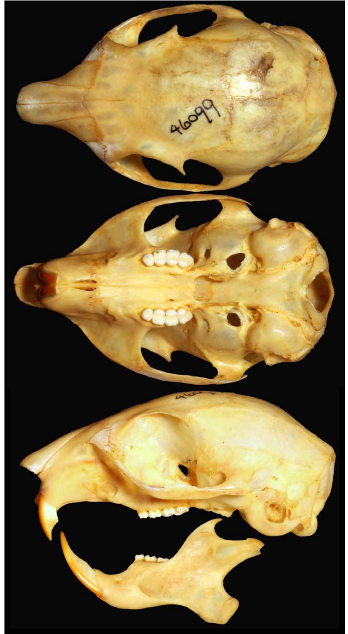
Fig. 3. —Dorsal, ventral, and lateral views of skull and lateral view of mandible of Sciurus ignitus (Field Museum of Natural History [FMNH] 46099, female collected on 20 June 1927 by F. B. Steinbach), from Chapare, Cochabamba, Bolivia, 2,000 m above sea level. Greatest length of skull is 50 mm.

Cranial features (Fig. 3) include 1 complete and 1 incomplete septa in the auditory bullae (Cassini and Guichón 2009). Mean cranial measurements of 10 S. ignitus deposited in natural history museums in Argentina (mm \pm SD, range in parentheses) included: maximum cranial length, 50.1 \pm 1.1 (48.1–52.1); zygomatic breadth, 28.9 \pm 0.8 (27.3–29.7); length of palate, 21.9 \pm 0.8 (20.0–22.7); length of diastema, 12.9 \pm 0.4 (12.3–13.6); interorbital breadth, 16.9 \pm 0.7 (16.0–18.4); length of nasals, 14.0 \pm 0.7 (12.6–15.0); length of maxillary toothrow, 8.4 \pm 0.4 (8.1–9.5—Cassini and Guichón 2009). Four specimens of S. i. irroratus from Inca Mines, Peru, had the following mean measurements (mm, range in parentheses): occipitonasal