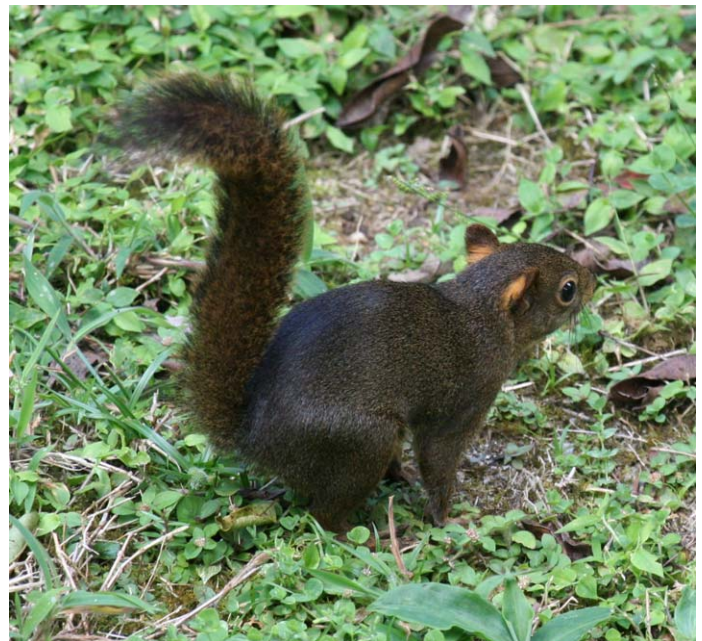
Fig. 1. —Adult Sciurus ignitus (sex unknown) taken at the Cock-of-the-Rock Lodge, Manu Road, Peru, July 2008.

Sciurus (Mesociurus) argentinus Thomas, 1921:609. Type locality “Higuerilla, 2000 m, in the Department of Valle Grande, about 10 km. east of the Zenta range and 20 km. from the town of Tilcara,” Jujuy Province, Argentina.