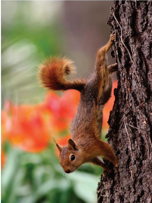
Fig. 4. —An adult Sciurus anomalus demonstrating the extreme flexibility at the crurotalar joint.

occurred (Gavish 1993), similar to scent marking by other tree squirrels (Gurnell 1987). Defecation occurs on branches (Gavish 1993).