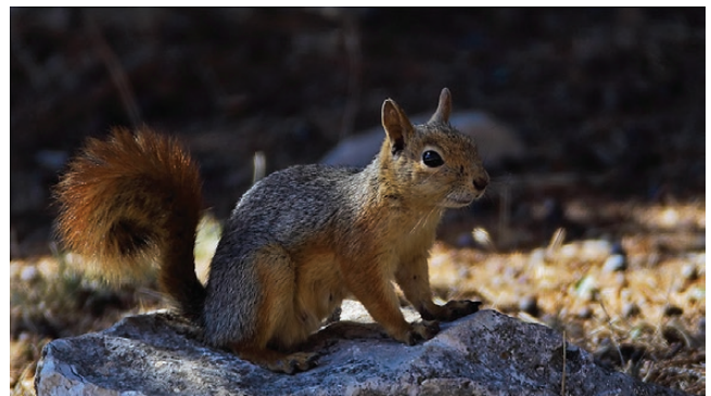
Fig. 1. —An adult Sciurus anomalus anomalus from Mersin, Mersin Province, Turkey.

CONTEXT AND CONTENT. Order Rodentia, suborder Sciuromorpha, family Sciuridae, subfamily Sciurinae, tribe Sciurini, subtribe Sciurina, genus Sciurus , subgenus Tenes