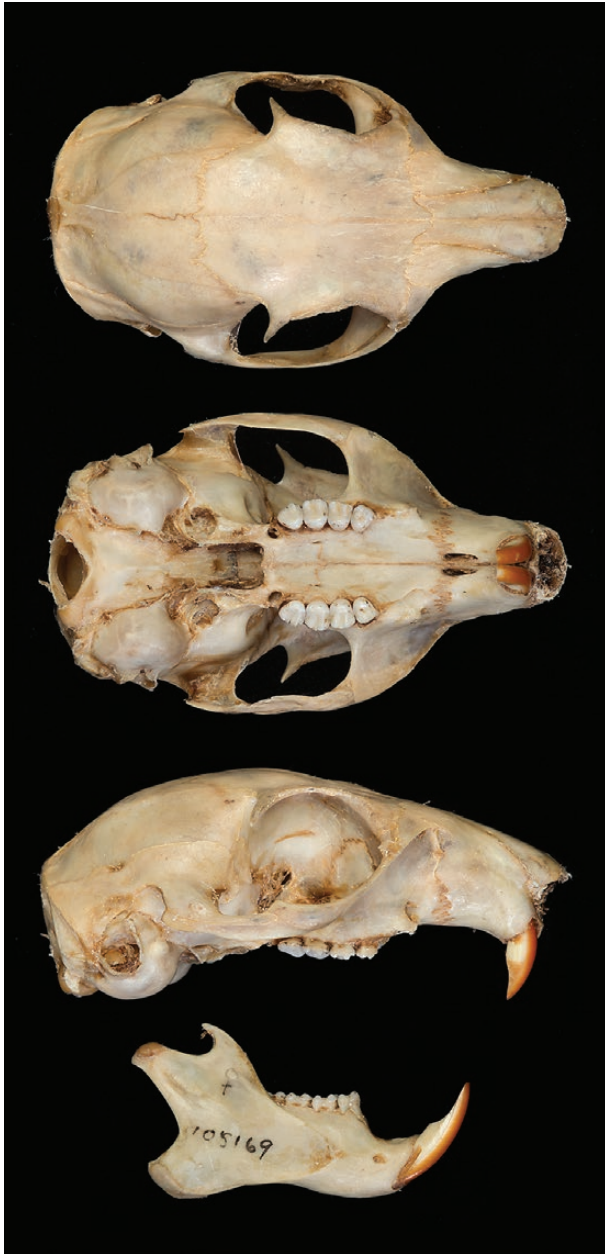
Fig. 2. —Dorsal, ventral, and lateral views of skull and lateral view of mandible of an adult female Sciurus anomalus (University of Kansas Biodiversity Institute [KU] #105169) from Yatağan, Denizli Province, Turkey. Greatest length of skull is 51.4 mm.

Fossils of the earliest Sciurus from the Miocene in Europe and North America are indistinguishable from the present-day genus (Emry and Thorington 1984). The M3 of S. anomalus was recovered at the Tourkobounia-1 locality and estimated to be from the early Villanyian (late Pliocene or early Pleistocene—De Bruijn and van der Meulen 1975) and was common in the middle Paleolithic in southern Turkey (Demirel et al. 2011) and late Paleolithic in Lebanon (Hooijer 1961; Kersten 1992). S. anomalus is known in the Levant from the late middle Pleistocene until the dawn of the Holocene (Tchernov 1988, 1992, 1994, 1997). The species appears to have spread southward during the last postglacial period and subsequently retreated northward away from Israel (except for current relict populations—Gavish 1993) in the late Pleistocene (Boessneck and von den Driesch 1974). Fossils of S. anomalus have been reported at several excavation sites in the Mediterranean maquis and forests in Israel including