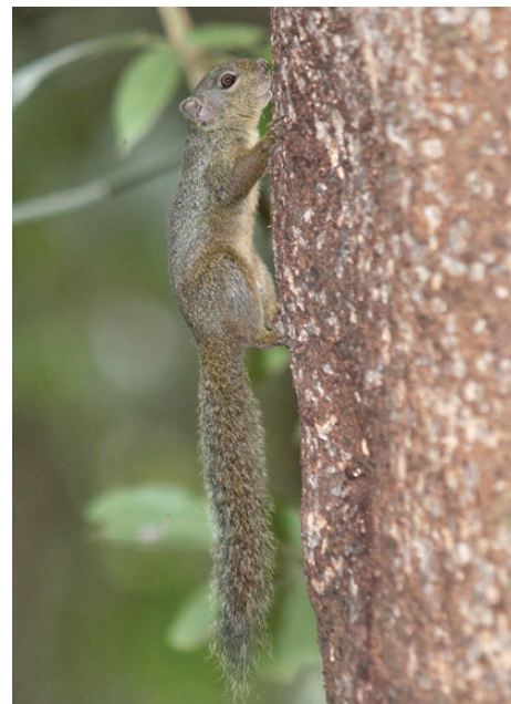
Fig. 1. —Adult Microsciurus flaviventer from Tiputini, Ecuador. Sex unknown.

Sciurus similis Nelson, 1899:78. Type locality “Cali, Cauca Valley, Colombia (alt. 6000 ft. [1828.8 m]).”