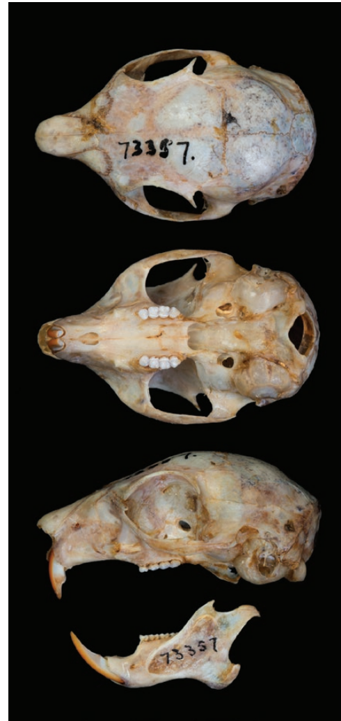
Fig. 2. —Dorsal, ventral, and lateral views of skull and lateral view of mandible of an adult (sex unknown) Microsciurus flaviventer (American Museum of Natural History [AMNH] #73357) from Puerto Indiana, Maynas, Loreto, Peru. Greatest length of skull is 38.5 mm.

Length of head and body in M. flaviventer ranges between 120 and 160 mm; length of tail is 80–155 mm; hind foot length is 39–43 mm; and ear length is 16–17 mm (Eisenberg 1989; Eisenberg and Redford 1999). M. flaviventer body mass ranges from 86.2 to 132 g (Eisenberg and Redford 1999; Haysen