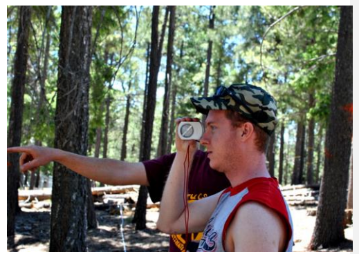
Figure 9: (6 photos above) Students learn conifer identification techniques and practice Rapid Ecological Assessment methods to study and compare the ecological conditions of the two forest sites – thinned and unthinned (Day 2)