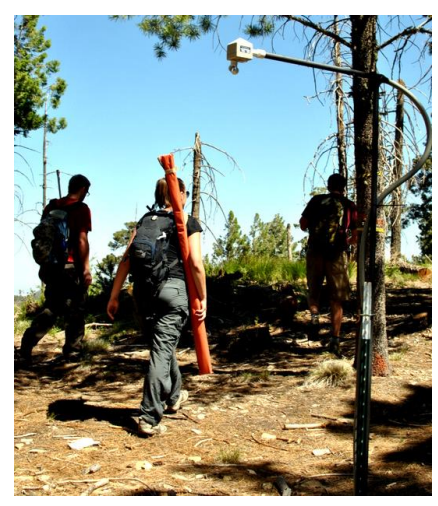
Figure 7: Long-term science monitoring infrastructure and instrumentation on Mt. Bigelow (Day 2)