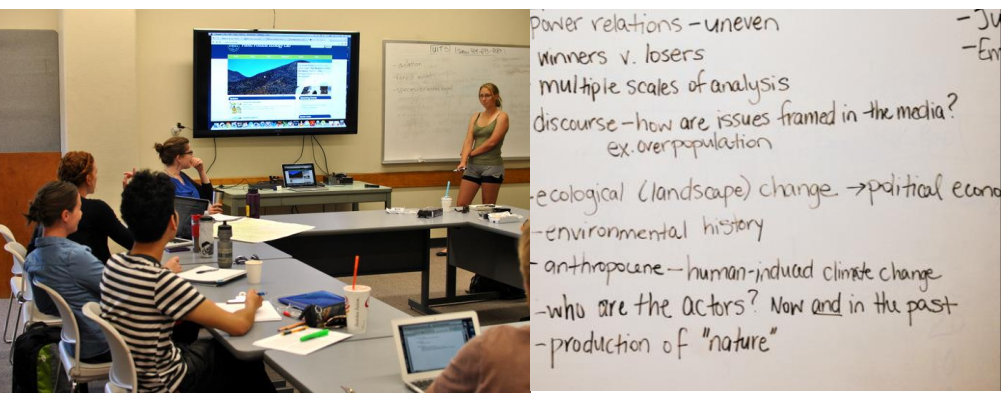
Figure 3: Discussion of pre-course readings and student-led white boarding of political ecology concepts (Day 1)

the pre-course readings, participants were also encouraged to share relevant insights from their own previous life experiences. Crucial points of discussion and debate swirled among the themes of uneven power relations, experts and expertise, dominant discourses, exclusion and dispossession, and social justice. Drawing on the diverse backgrounds of the graduate students in forest ecology, hydrology, and fire science, and our stated commitment to maintain a balanced focus on ecology and politics, we consciously worked to tie insights from social theory to transformations in the biophysical environment. However, not unlike Walker's warning, we found maintaining a serious and ongoing engagement between social theory and ecological theory challenging.