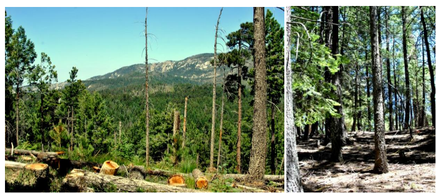
Figure 2: Mt. Bigelow field sites (Left image: Highly managed forest site; Right Image: 'Pristine' old growth forest site)

unique, high elevation forest within the larger Sonoran desert landscape, and has been (and continues to be) the site of numerous scientific investigations.