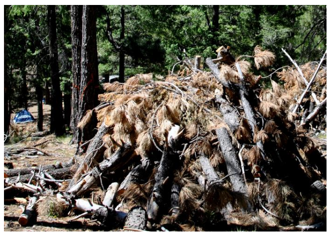
Figure 6: The foreground of this image shows debris from forest management practices, while in the background a blue tent of a recreational camper is visible (Day 2)