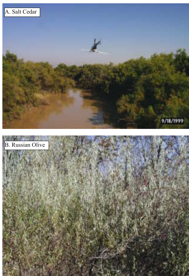
Figure 2. (a) Riparian salt cedar along the Pecos River in Texas receiving herbicide application by helicopter. (b) Russian olive along the Rio Chama, New Mexico. Note the high-density, monoculture habit of both nonnative plant types.

increase in streamflow and groundwater recharge; and under what conditions? How might hydrological factors control the pattern and rate of spread of nonnative species, their interactions with native species, and their ultimate geographical range? How do riparian communities dominated by exotics respond to drought? How do they affect fundamental ecosystem processes, such as primary production, decomposition, and nutrient cycling? Does the establishment of exotic plants alter disturbance regimes (e.g., pest outbreaks, fire) in ways that will modify local hydrology? Such questions can be answered only through coupled studies of the hydrology and ecology of riparian corridors. Indeed, the growing field of ecohydrology could make a lasting and socioeconomically vital contribution to the health of these environments by undertaking studies that focus on nonnative riparian plants.