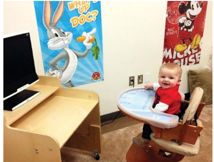
McClelland Institute Lang Lab

Eye-tracking is a recent advance in eye gaze technology that non-invasively captures the gaze patterns of very young children. Using dynamic social scenes of Peter Pan, infants and toddlers participate in the project in the Lang Lab. By creating specific areas of interest, such as the eyes and the mouth, data is gathered on the frequency and duration of time that infants and toddlers looked at an event. Preliminary results showed that more fixations were made towards eyes and mouth versus objects. These results support the notion