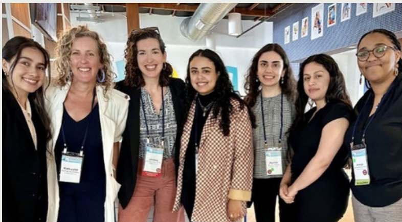
FMI-affiliated faculty and students presented posters at the SRA 2023 Annual Meeting: Keeping Pace with a Changing World.