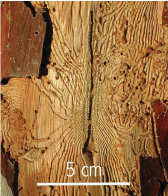
Figure 2. Cypress bark beetle gallery in Arizona cypress trunk.