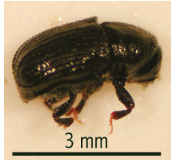
Figure 1. Close-up of a cypress bark beetle.

After the eggs hatch, the larvae (grubs) create new galleries which radiate outward from the central gallery (Figure 2). As they consume the inner bark (phloem), cambium, and outer sapwood, the tree is girdled cutting off the flow of nutrients to the lower portion of the tree. Beetle colonization often causes top-kill and branch