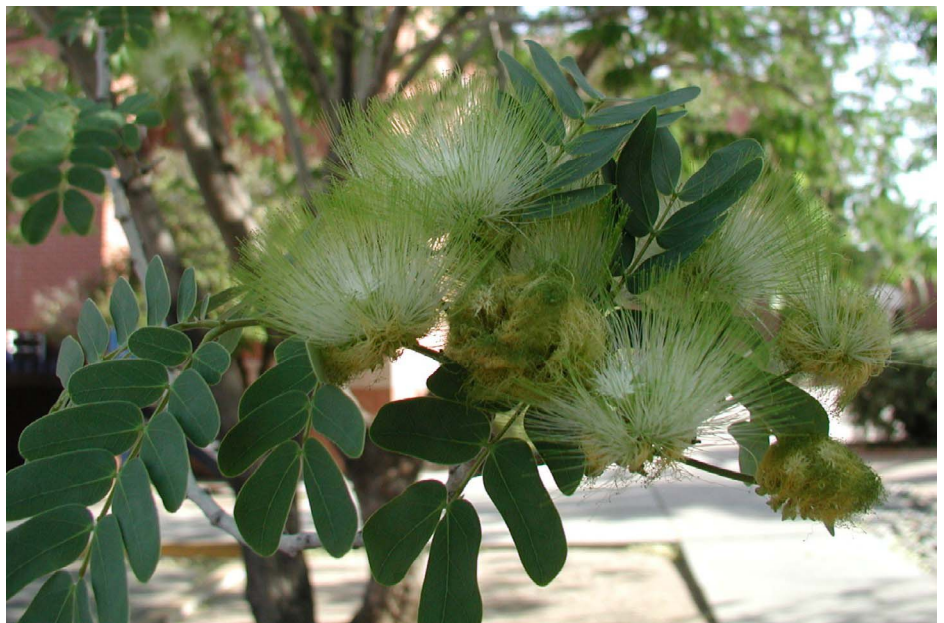
Albizia lebbbeck (ED)

Apparently this species can tolerate less moisture than what we think of as tropical conditions. Purdue University's New Crops web page ( http://instruct1.cit.cornell.edu/courses/hort400/mpts/ ) reports that siris tree can thrive on over 1460 mm (5 ft) of rainfall a year. No chance of