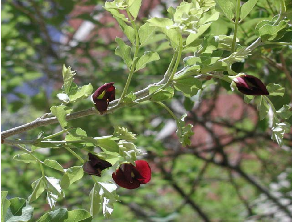
Brongniartia alamosana (ED)

flower color. Petals shade from deep red to dark maroon. Centers are lime green. Blooming is most heavy during monsoon season here in Tucson. Through the humid days of August and September, the brown/maroon pea-shaped flowers never fail to inspire questions. Like many pea-shaped flowers, they are self fertile, and form flat pods, 2-3" (4.5-6.0 cm) long.