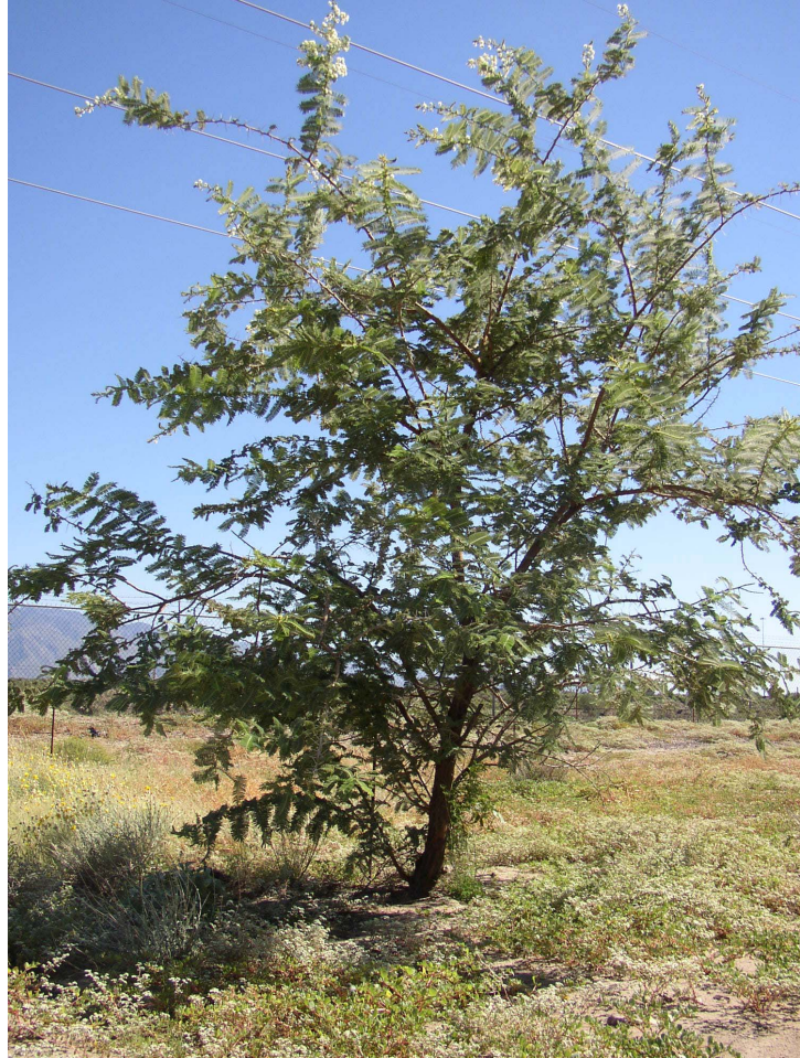
Acacia rehmanniana, West Campus Delep field

The Desert Legume Program has received a grant for $65,000 from the Wallace Research Foundation. A portion of this grant will support the new project Legumes of Arizona: An Illustrated Flora and Reference . The Wallace Research Foundation has underwritten projects of the Desert Legume Program for many years, and we are grateful for their continuing support.