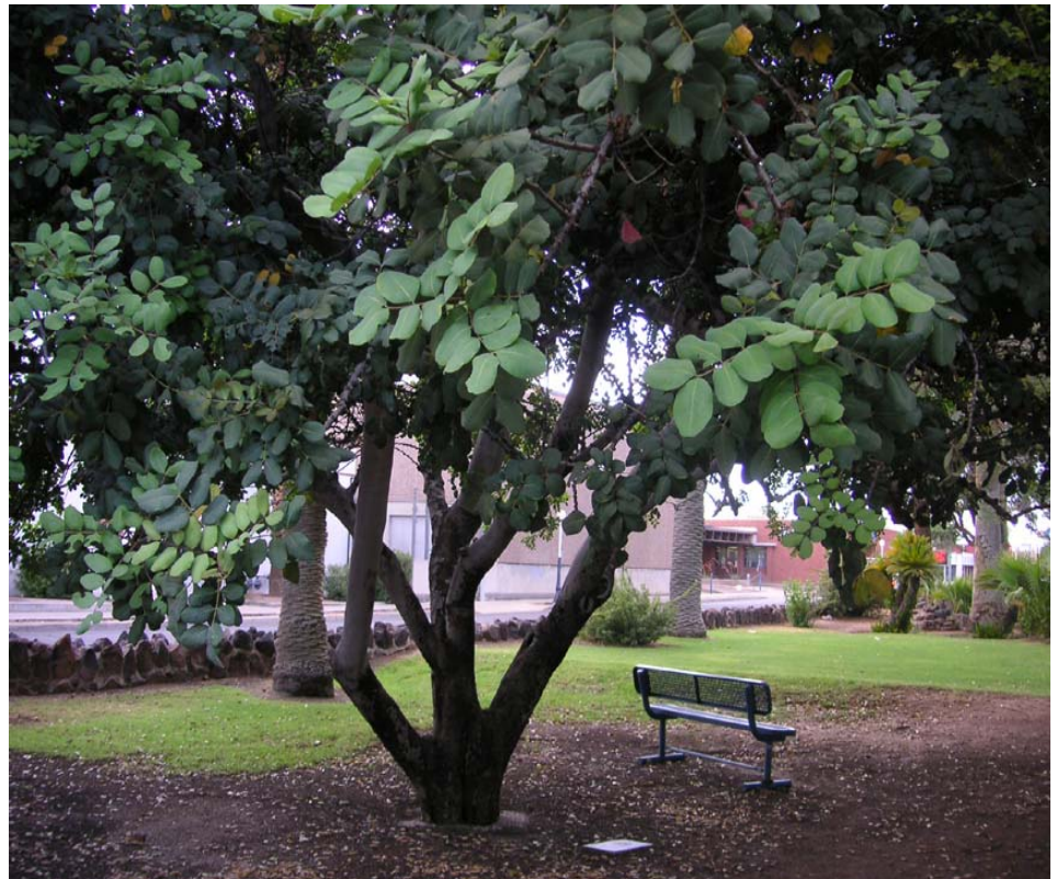
Ceratonia siliqua (ED)

While its size can make it unsuitable for a patio tree, carob has been providing shade and shelter for desert dwellers for centuries. It is a perfect park tree for Tucson and the middle to low deserts. Visit the University of Arizona - and pause under the wide dark canopy of these beautiful trees.