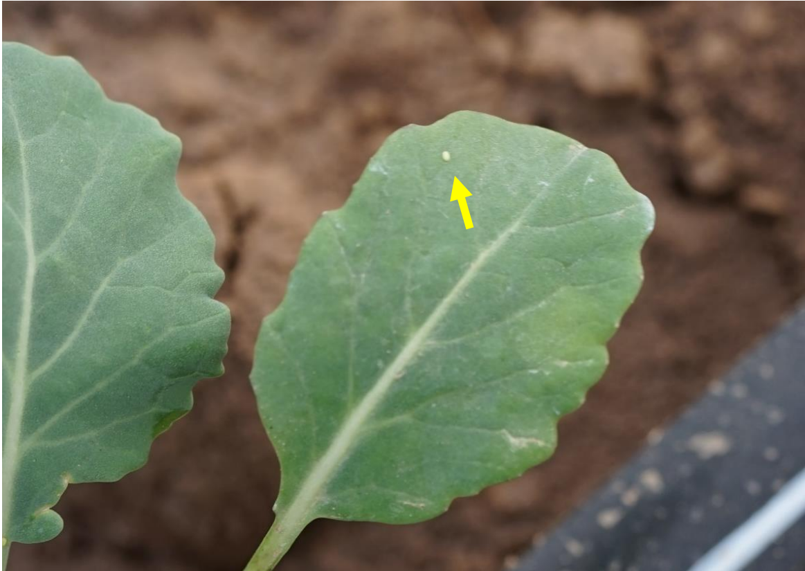
Figure 3. DBM eggs on cabbage transplant