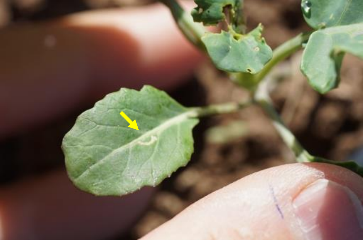
Figure 4. 1 st instar DBM larva mining in broccoli cotyledon.