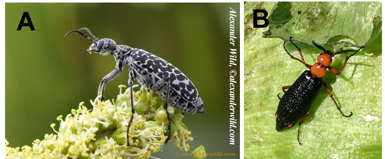
Figure 2. The Spotted Blister Beetle, Epicauta pardalis A, on a flowering plant and B, Lytta magister on iceberg lettuce. The iron cross beetle, Tegrodera aloga , found in a spinach field, C.