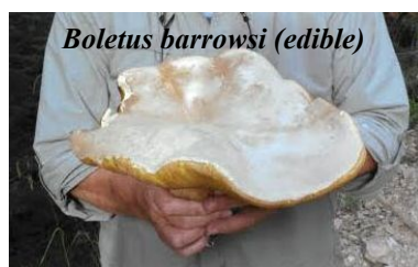
Boletus barrowsi (edible)