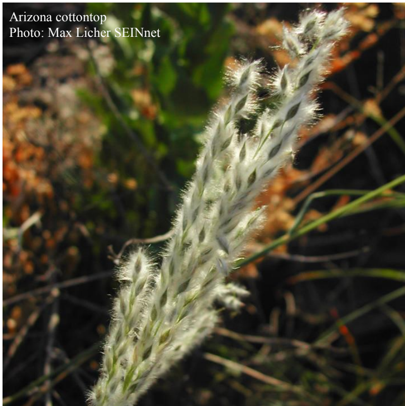
Arizona cottontop

If I were a hummingbird, I would line my nest with the seeds of Arizona cottontop , Digitaria californica . The large seeds are sur-