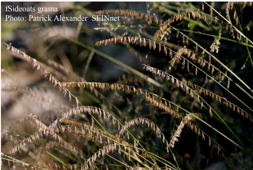
fSideoats grama

Sideoats grama looks exactly as named. The seeds hang down along the culm (stalk) like oats. Sideoats grass is very common and very