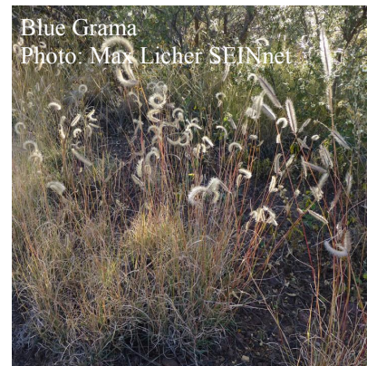
Blue Grama

Blue grama grass makes me smile. When the 2.5-4 cm long