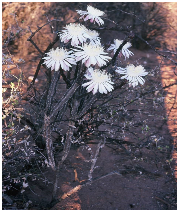
(Cochise Cactus Calendar continued from page 5)

lbs.) which, unfortunately, javelinas will occasionally dig. This reservoir of nutrients and water will sprout new stems when the weather is promising. The Queen comes closer to being a deciduous perennial than any other cactus and can seem to disappear then reappear later.