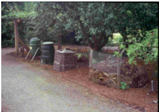
Some examples of compost containers. Drum composters aid in aeration. Plastic containers may sun-rot.