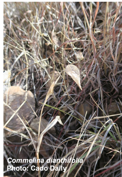
Commelina dianthifolia

The large, dried bracts, called "spathes," that enclose the flowers of the brilliant blue birdbill day-flower, Commelina dianthifolia , are easy to find in the winter, as well as in the summer, because their shape is illustrative of the birdbill's common name with the broad sheath tapering to a long point.