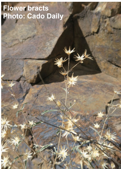
Flower bracts

Take for example the perennial, but cold sensitive Chihuahuan brickellbush Brickellia floribunda , a common plant growing in the drainages in the Mule Mountains. This woody, small shrub has multiple pithy 2-3ft stems with sticky, fragrant leaves. The flower is not showy and is typical of some Asteraceae family plants with clusters of small cream-colored flowers, similar to those on the familiar desert broom.