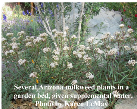
Several Arizona milkweed plants in a garden bed, given supplemental water.

Milkweed plants are finally getting the recognition they deserve, due in part to publicity about the decline of Monarch butterflies, as well as the popularity of butterfly and pollinator habitat gardens. All milkweed flowers are an important source of nectar for insects as well as the food plant for the caterpillars of Monarch and Queen butterflies and a few tiger moths. In addition to their wildlife benefits, milkweeds are a versatile group of plants for a garden setting, forming low clumps, vines, or five foot tall stems with variously colored blossoms.