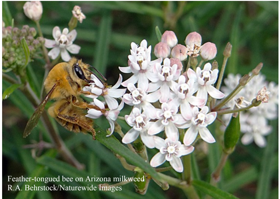
Feather-tongued bee on Arizona milkweed