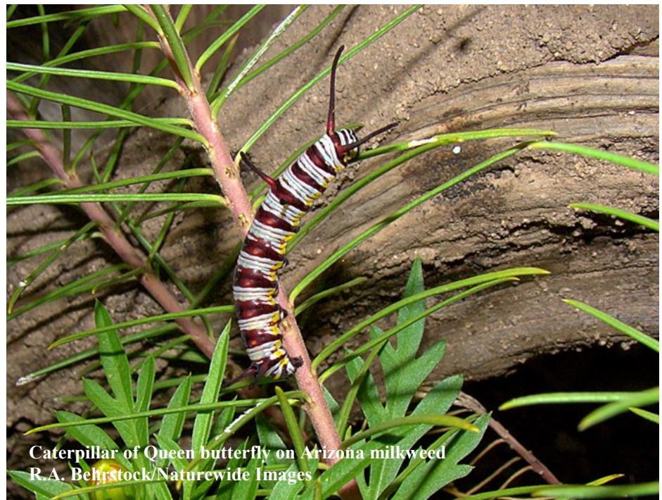
Caterpillar of Queen butterfly on Arizona milkweed

"How deeply seated in the human heart is the liking for gardens and gardening."