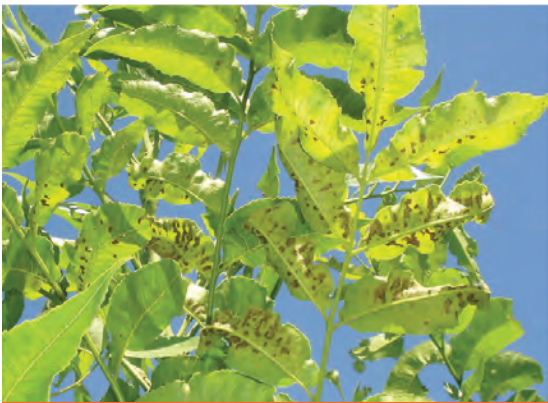
Figure 5. Iron deficiency symptoms (top photo) and zinc deficiency symptoms (bottom photo) in pecan leaves.

will vary depending on soil texture and the calcium carbonate content. The following rates are suggested as starting points: one-half ounce (14 grams) per cubic foot of soil in sandy soils, one ounce (28 grams) per cubic foot of soil in silty soils, and two ounces (56 grams) per cubic foot in clay soils. Sulfur should be thoroughly mixed with the soil. Application of too much sulfur can over-acidify the soil, a situation that should be avoided (soil pH should be kept above 6.0). See Hart et al (2003) for additional information on acidifying soils.