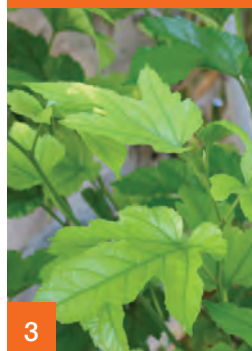
3 Mulberry showing iron deficiency symptoms.