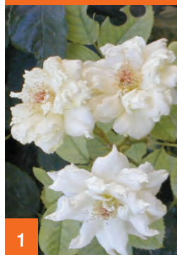
1 Iron deficiency is common in domestic roses.