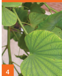
4 Iron deficient purple orchid tree.