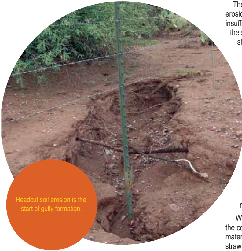
Headcut soil erosion is the start of gully formation.

So, walk around your backyard and take a good hard look at the soil conditions. Topsoil in our desert climate is typically less than four inches deep. It has plant roots, fungi, worms and insects and supports a variety of plants and small animals. Dead organic material (litter) covers and provides soil surface protection and as it decomposes, humus is produced by microorganisms. This provides spaces between the mineral particles of your soil which means that the soil structure can both absorb water and support more plant growth (cover).