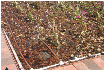
Fig. 3. Overwatering and poor drainage caused the decline of globe amaranth. Symptoms can also be caused by root diseases.