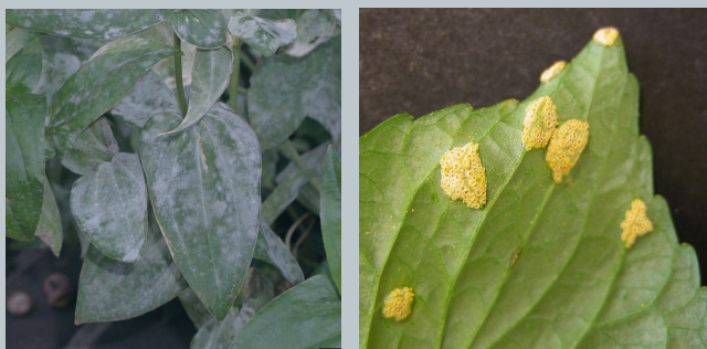
Fig. 6. Symptoms of powdery mildew (top) and rust (bottom).

If annuals stop blooming or decrease significantly in growth after the first set of flowers has bloomed, lack of several nutrients can be the problem. Adding a complete fertilizer which contains nitrogen, phosphorous and potassium at regular intervals will stimulate more flowers and vegetative growth. Light green foliage starting with older leaves suggests lack of nitrogen and in severe cases the foliage can turn yellow. Regular application of fertilizer will prevent this and foliage should turn green within a couple of days. Other symptoms of nutrient deficiency or excess include smaller, distorted leaves, fewer leaves, weak stems, and discoloration of leaves.