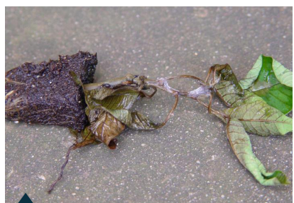
Fig. 5. Rhizoctonia (top) and Pythium (bottom) fungi caused root and stem rot.

flower buds or on the underside of leaves. Knowing the cultural practices and the history of a site, such as an irrigation system breakdown, flooding, or cold temperatures, can assist in trouble shooting. The origin of a problem should be positively identified before implementing control treatments. This may require laboratory analysis of a fungus or identification of an insect. Early detection may allow for control of an insect or disease problem with a simple spot treatment or by removal of damaged leaves or plants before a large area becomes affected. In all cases, selection of appropriate species for the season and the site, while implementing appropriate maintenance practices will prevent many problems in bedding plants.