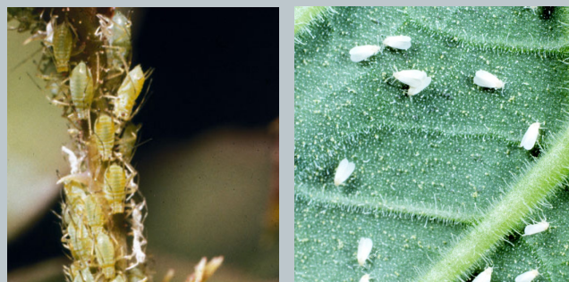
Fig. 7. Aphids (top) and adult whiteflies (bottom) feed on leaves and stems.

Powdery mildew and rust are fungal diseases found on the leaves, stems, flowers, and fruit of bedding plants (Fig. 6). Powdery mildew appears as white or gray powdery spots on the