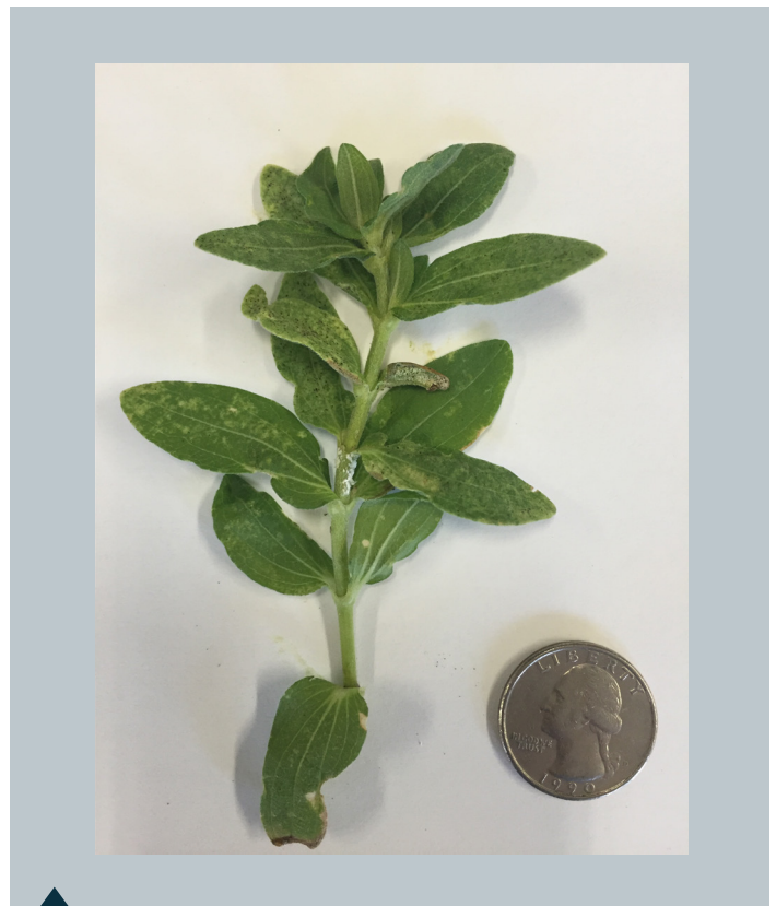
Fig. 2. Zinnia with symptoms of insect infestation and disease.

When a plant is not thriving, the leaves, shoots, flowers, and soil should be examined closely to look for symptoms and determine the cause. Poor color foliage, leaves shriveling or falling off, or evidence of insects or disease on the plant indicate a health problem (Fig. 1 and 2). Small, stunted plants, lack or damage to flowers or flower buds, and plants falling over require close inspection to determine the cause. Soil that is too dry or too wet can be a problem and pulling out the roots of damaged plants can help to diagnose potential root issues. Following are ten of the most common bedding plant problems encountered in the arid climate of the Southwestern United States. The first five are abiotic problems caused by factors such as drought, wind, freezing or overwatering; the next five are biotic problems, caused by different organisms. When trouble shooting, symptoms such as wilting foliage, yellowing leaves, and stunted growth are non-specific and may result from different causes. Some insects damaging plants may hide in