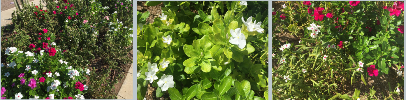
Fig. 1. Vinca showing symptoms of drying plants right next to healthy plants (top), severe chlorosis (center), and wilting (bottom). Close up inspection of shoots and roots and possibly laboratory analysis are necessary to identify the cause and implement control treatments.