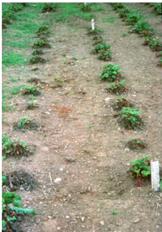
Figure 4. Red stele root rot of strawberry ( Phytophthora fragariae ).

o-o), or the equivalent, per 100 square feet (0.3 pounds of actual nitrogen), in several applications. Scatter the fertilizer on the ground and wash it off the leaves to prevent salt burn before irrigating. If possible, work fertilizer into the ground prior to the next irrigation. If drip irrigation is used for watering, fertilizer can be injected into the system. If injection is used, reduce the amount of nitrogen applied by ½ to prevent nitrogen burn.