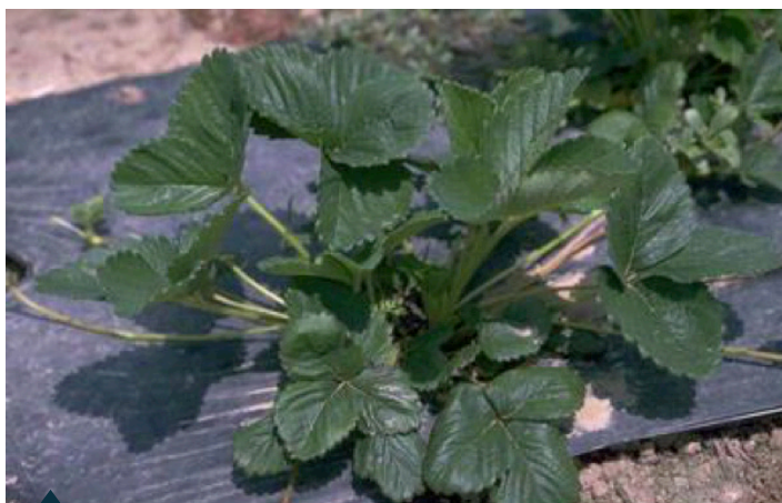
Figure 3. Strawberries planted through plastic mulch.