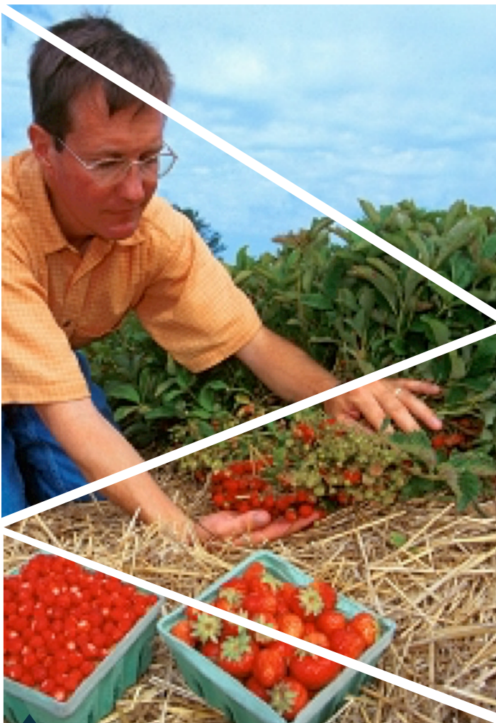
Figure 1. Two wild varieties of strawberries used for breeding purposes.

▶ Tom DeGomez Former Area Agent - Agriculture (Coconino & Mohave), Cooperative Extension, Coconino County University of Arizona