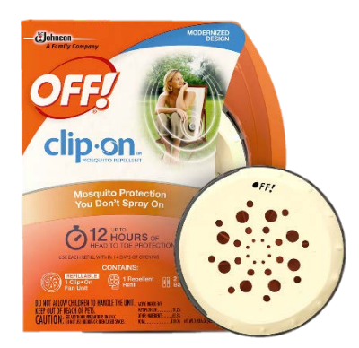
Off! Clip-on wearable device containing 31.2% metofluthrin.

Ingredients vary, but research supports that metofluthrin and allethrin significantly reduce contact with mosquitoes through a combination of repelling and killing the approaching vector. Spatial repellent devices should only be used outdoors. Ticks are not specifically included on spatial repellent labels , but there is evidence showing ticks are affected by some spatial repellents.