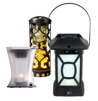
Candle and lamp devices that could contain various spatial repellent ingredients