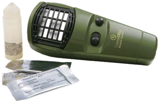
ThermaCELL appliance containing 21.9% d-allethrin.