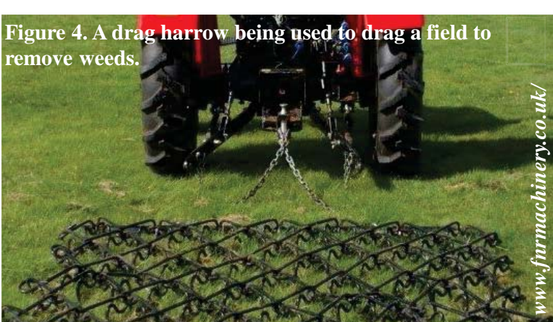
Figure 4. A drag harrow being used to drag a field to remove weeds.