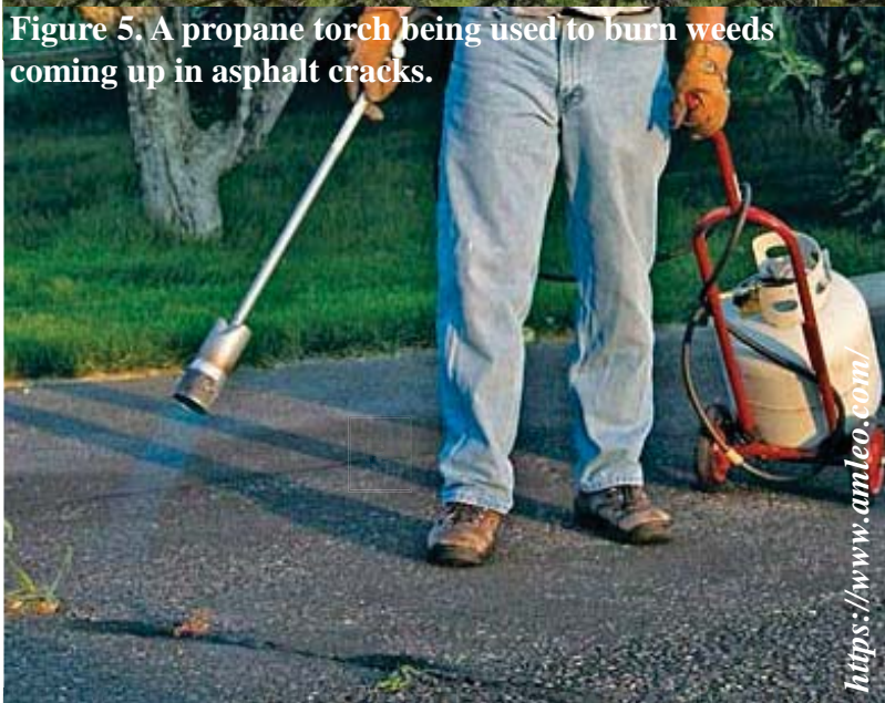
Figure 5. A propane torch being used to burn weeds coming up in asphalt cracks.