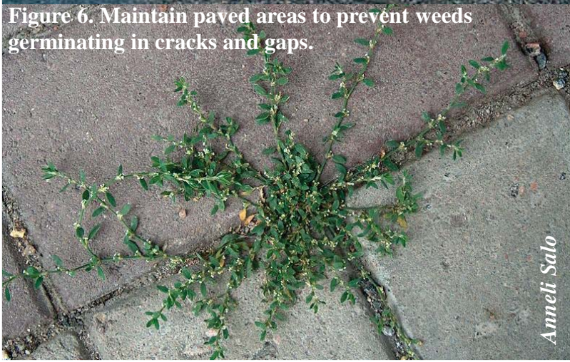
Figure 6. Maintain paved areas to prevent weeds germinating in cracks and gaps.