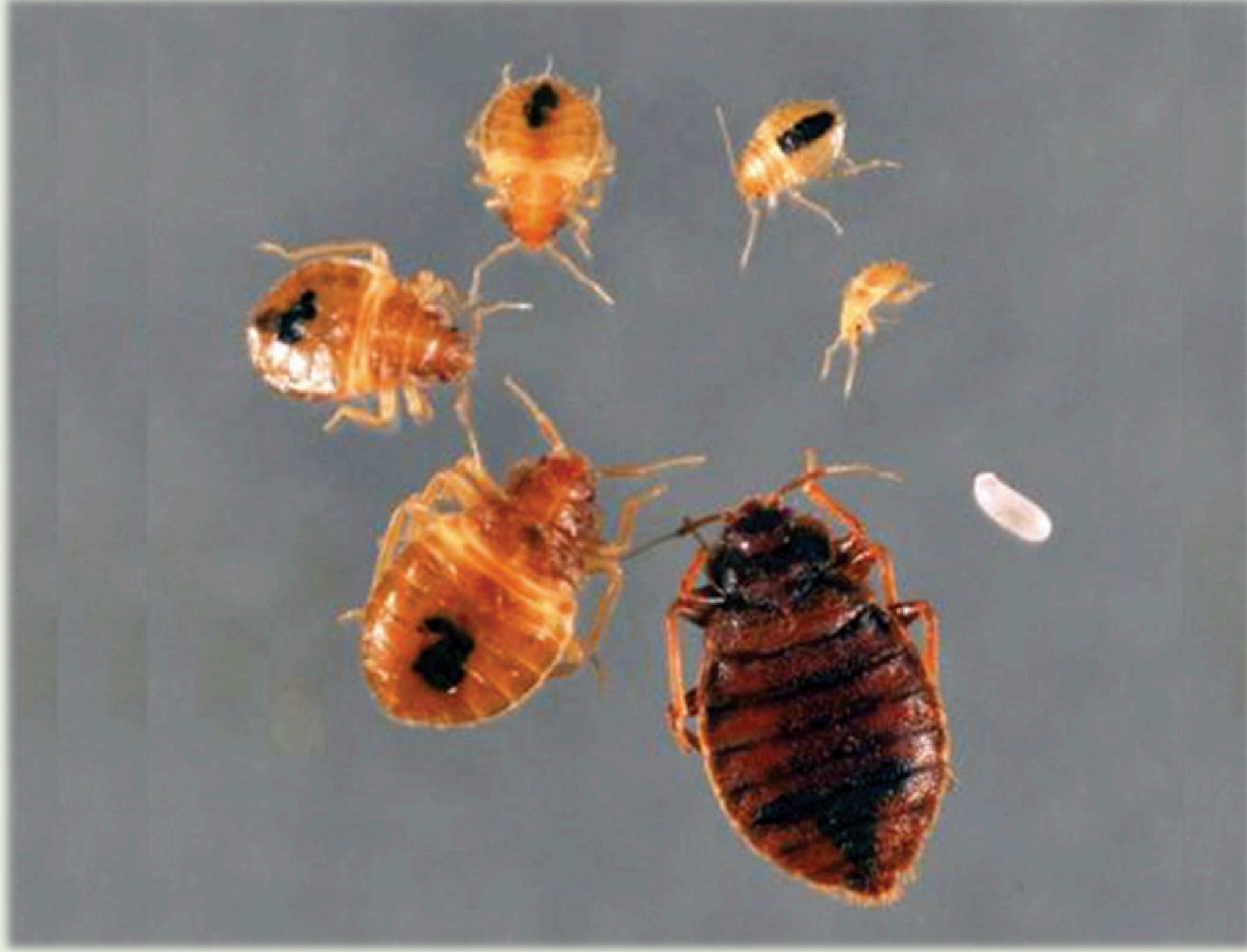
The Bed Bug Life Cycle

Bed bugs are small insects that feed on blood. They can be found in and near beds. They like hiding in crevices such as seams, joints, cracks and folds of the bed, furniture, walls, clothing and floor close to beds.