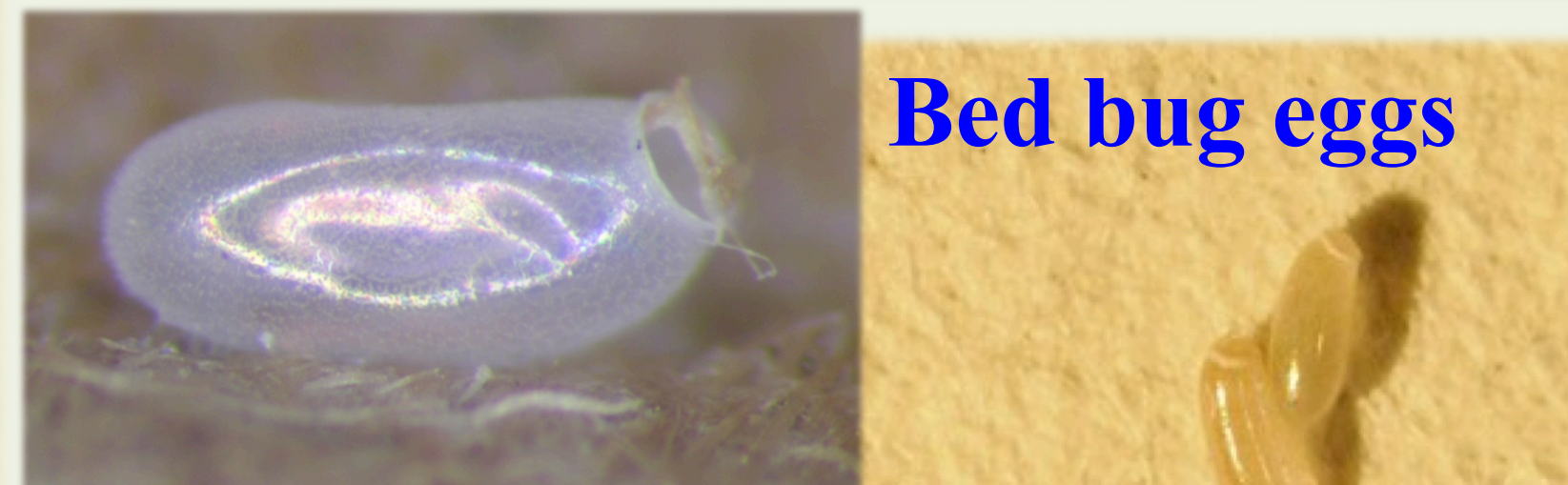
Bed bug eggs