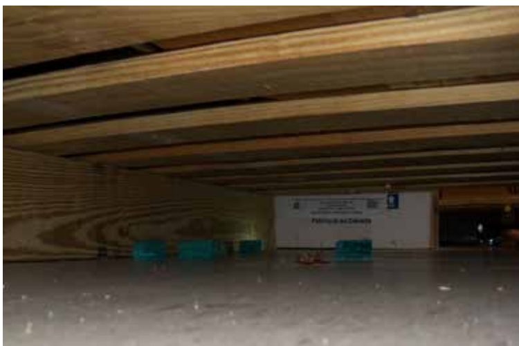
Fig. 2. Underneath a dry storage pallet: illegal placement of rodent bait blocks, evidence of American cockroaches, and general uncleanliness.

Federal roles in pesticide safety and IPM are addressed in the Federal Insecticide, Fungicide, and Rodenticide Act (FIFRA, 1947, 2007), which provides for federal regulation of pesticide distribution, sale, and use. Under FIFRA, all pesticides distributed or sold in the U.S. must be registered by U.S. EPA unless they meet specific criteria for exemption, such as containing ingredients generally recognized as safe (7 U.S.C. § 136e). U.S. EPA