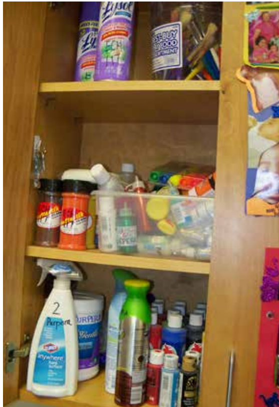
Fig. 3. An example of how pesticides often stored on school grounds, in a closet or area with additional types of supplies.

“legacy” pesticides in storage (Green et al. 2007). In some states, the combination of poor storage practices and a lack of requirements for applicator training could have potentially harmful consequences (Fig. 3).