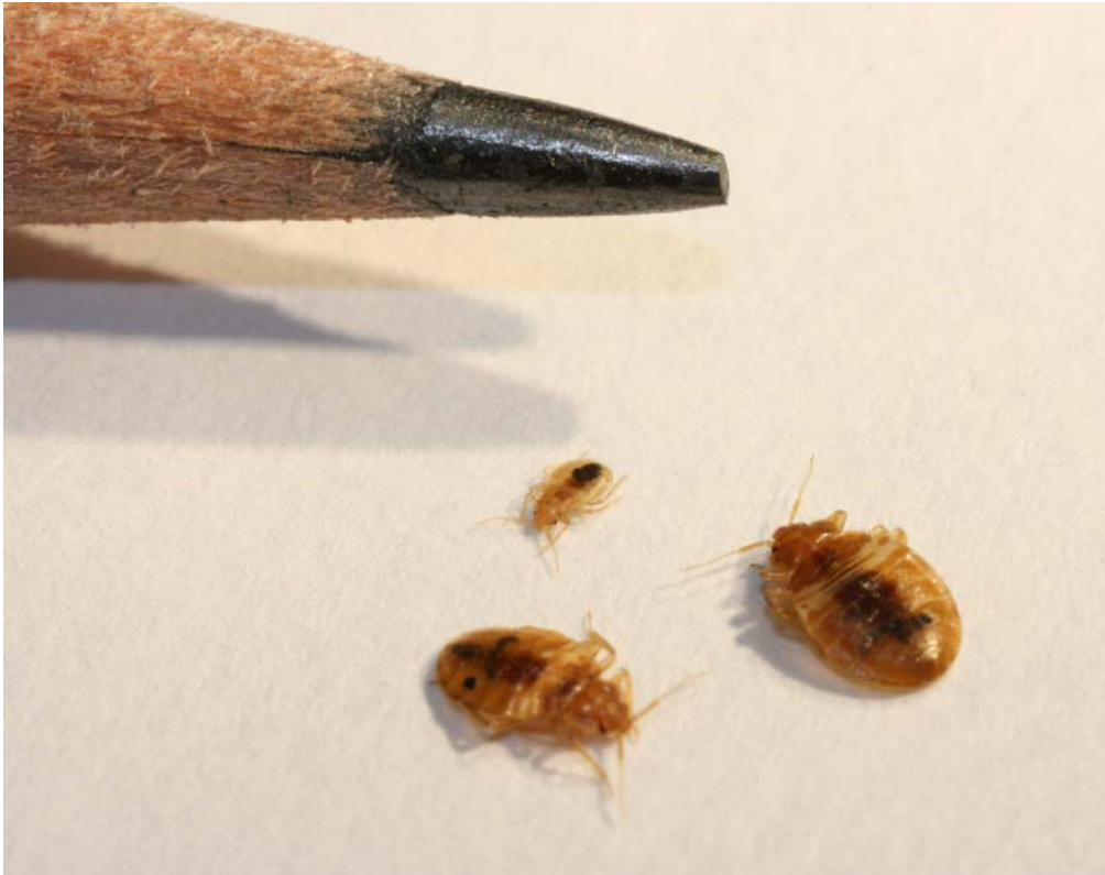
Bed bugs next to a pencil point for scale.