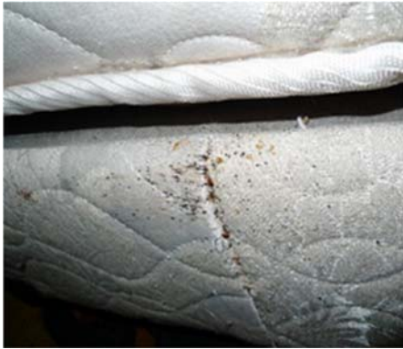
Dark spots on your bed.