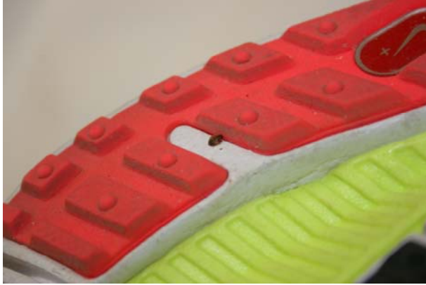
A bed bug hitching a ride on the sole of a shoe.