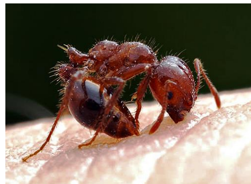
Fire ants bite and sting.

Fire ants of all species bite and sting, and they can do both simultaneously. They are aggressive when stinging and inject venom, which causes a burning sensation. People vary greatly in their sensitivity to fire ant stings . Some people may experience mild discomfort, while others may be hypersensitive to venom or may have medical conditions (e.g., heart condition, diabetes) that can result in serious medical problems or even death resulting from a single sting. Individuals with a history of severe allergic reactions to insect bites or stings should consider carrying an epinephrine auto injector ( EpiPen )