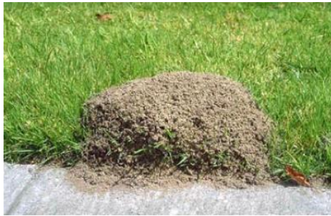
Red imported fire ants produce mounds that rise high above ground.