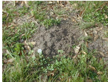
Southern fire ant nests have fine-grained low mounds with many openings.