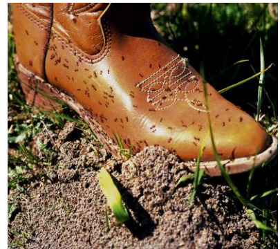
Red imported fire ants swarming boot after mound disturbance.