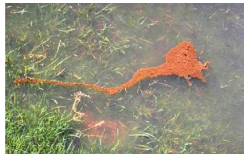
Red imported fire ant colony floating in flood water.

The red imported fire ant has been regularly introduced into Arizona, and is also present in the bordering states of New Mexico and California. The drier climate in Arizona is a limitation for this species, however, as we irrigate more lawns, agricultural fields, and golf courses, we increase our chances of making RIFA flourish. RIFA invade via transported nursery stock, honeybee colonies, and on empty trailers and trucks. Areas with seasonal flooding are particularly vulnerable to RIFA invasion. Fire ant activity increases after rain events. Be on the lookout for colonies in new areas after rain.