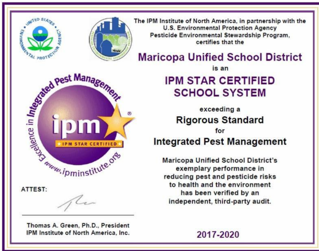
Maricopa Unified School District, AZ earned IPM STAR Certification for excellence in school