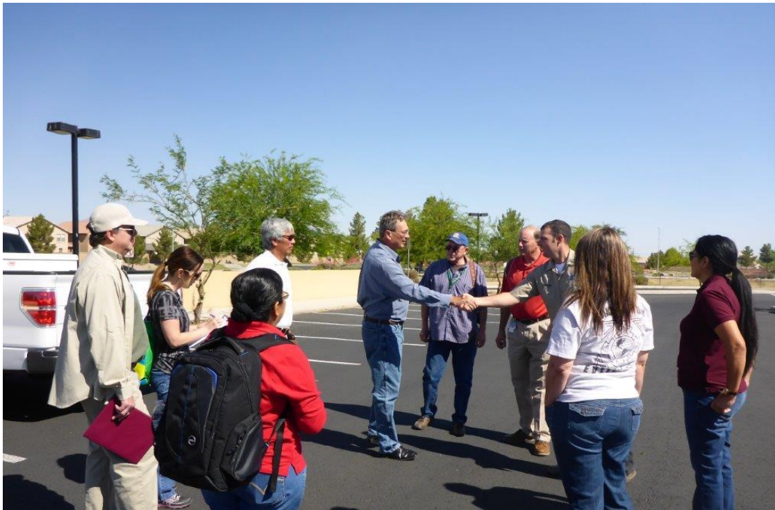
Team members meet school staff before an IPM visit

One of the major programs conducted by the University of Arizona (UA) Community IPM Team is the Arizona School Integrated Pest Management Program . Our approach to implementation of IPM in schools includes both indoor and outdoor environments. Some of the common problems in school indoor spaces are cockroaches, bed bugs, mosquitoes, ants, flies and rodents. Outdoor issues faced by schools include mosquitoes, stinging insects, weeds, poor turf and irrigation management and improper selection of landscape plants. These issues often result in unnecessary expenses and under-utilization of the full potential and functionality of school indoor and outdoor environments, causing anxiety and stress to students, teachers staff and parents.