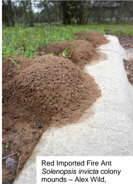
Red Imported Fire Ant Solenopsis invicta colony mounds