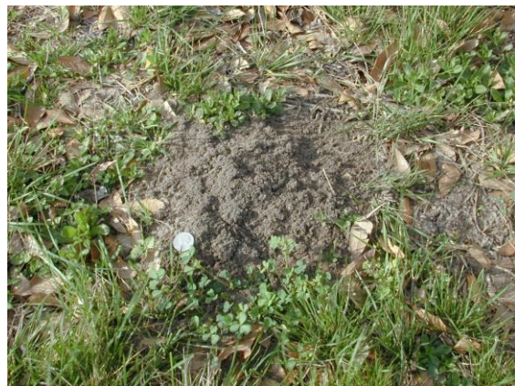
Native Southern Fire Ant Solenopsis xyloni colony mound