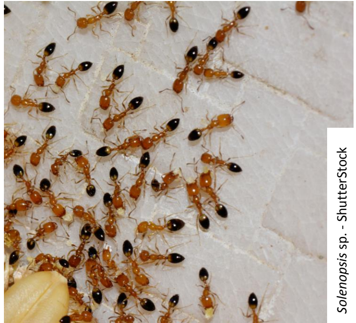
Solenopsis sp.

How does that all feel? Well irrespective of fire ant species it feels rather like a burning sensation. But the most significant risk associated with both native and imported fire ants is not the sting but potential hypersensitivity allergy responses which can be life-threatening. People vary greatly in their sensitivity to stings. Some may experience short-term sting-site discomfort, while others may be hypersensitive to venom or may have medical conditions (e.g., heart condition, diabetes) that can result in serious medical complications. Individuals with a history of severe allergic reactions to wasp, bee or ant stings should consider carrying an epinephrine auto injector ( EpiPen ) and should wear a medical identification bracelet or necklace stating their allergy. Around 1% of children and 3% of adults are allergic to Hymenopteran (bees, wasps, and ants) insect stings making fire ants a high priority pest for school and childcare facility managers.