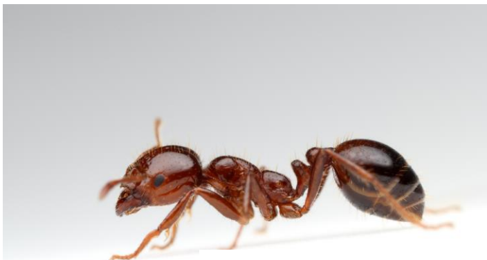
The Red Imported Fire Ant Solenopsis invicta – Alex Wild, www.alexanderwild.com

3. Seek emergency medical attention immediately if a sting causes difficulty breathing, swallowing, fainting, chest pain, nausea, severe sweating, loss of breath, serious swelling, or slurred speech. Anaphylactic shock can be life-threatening.