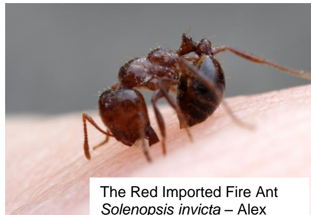
The Red Imported Fire Ant Solenopsis invicta – Alex Wild, www.alexanderwild.com

Justin describes native fire ants as a common nuisance to anyone with a yard, but judges their venom to be relatively mild. If stung by a native fire ant Justin says that you can expect a sting to be “sharp, sudden, mildly alarming. Like walking across a shag carpet and reaching for the light switch.” Red imported fire ants are more aggressive and a higher number of stings may occur very quickly. Fire ant venom contains alkaloid compounds called piperidines that are quite frankly super nasty toxins. Piperidines are neurotoxic (altering the normal activity of nerves), cytotoxic (causing cell damage), and hemotoxic (destroying red blood cells and causing tissue damage). Piperidine compounds in the venom of different species are unique to that species, so reactions differ accordingly. Red imported fire ant stings