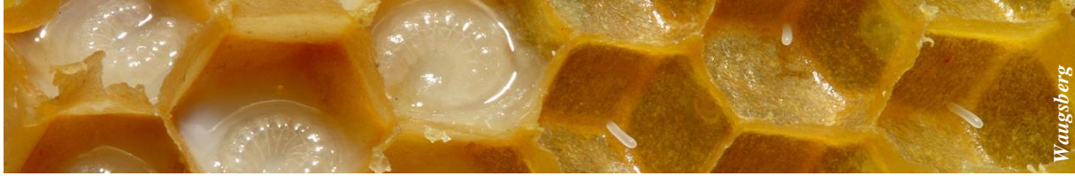
Figure 5. Section through honey bee hive showing eggs and larvae

All wild honey bees in Arizona are 'Africanized', please treat them with extreme caution.