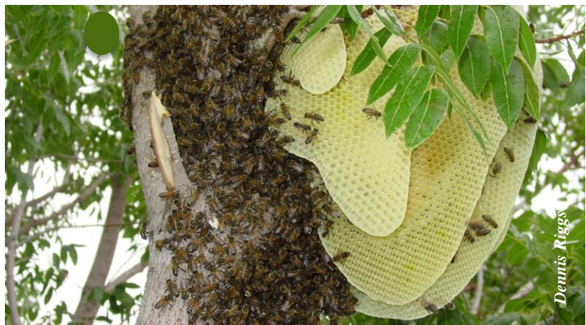
Figure 2. Wild honey bees with their hive in a tree