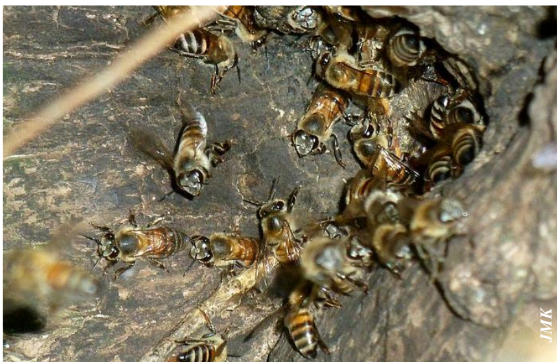
Figure 11. Honey bees near a nesting site in a tree cavity