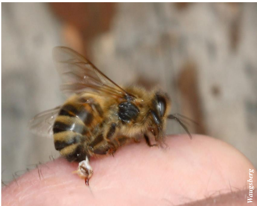
Figure 10. Honey bee stinger lodged in skin and separated from bee's body

Prevent bees from nesting in and around your home. Honey bees need food, water and shelter to survive. Restricting access to suitable nesting sites will encourage them to go elsewhere to live.