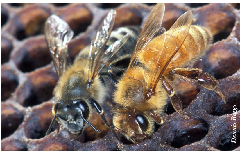
Figure 3. Africanized honey bee (left) and western honey bee (right)

The hive also contains eggs, larvae ("brood") and pupae in various stages of development (Fig. 5). Newly mated young queens leave their home colony with a group of workers to form a new colony, in a process called " swarming " and the group is called a " swarm ".