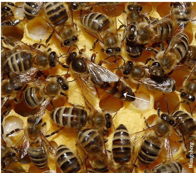
Figure 4. Honey bee colony with the queen (center, arrow) surrounded by workers