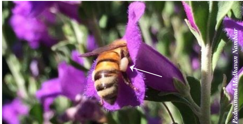
Figure 1. Pollination by honey bees. Note pollen loaded on hind leg

'Africanized' honey bees, also inaccurately referred to as 'killer bees' are descendants of hybrids between the African