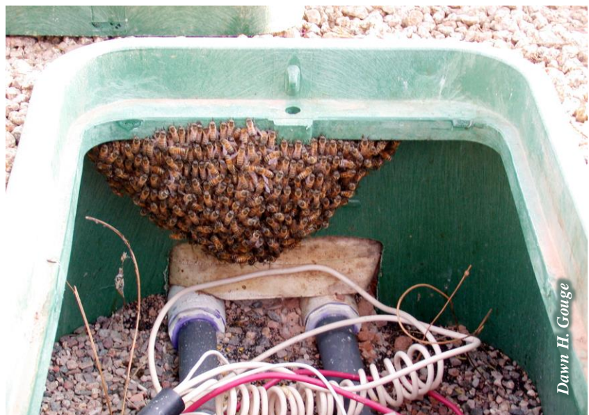
Figure 8. Honey bees starting to nest inside an irrigation box after entering through the hole in its lid