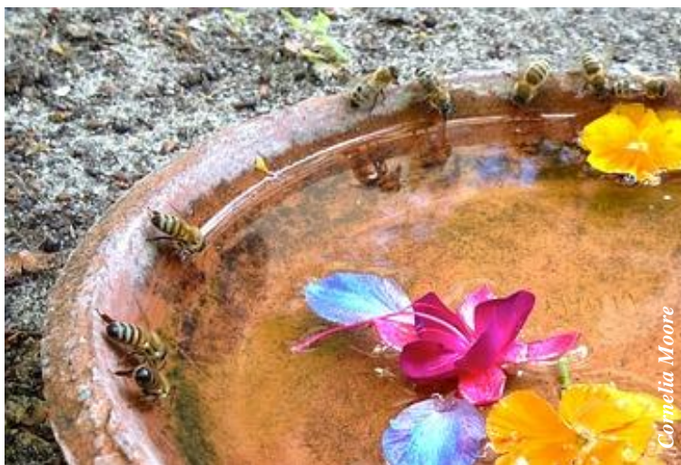
Figure 12. Honey bees drinking from a bird bath