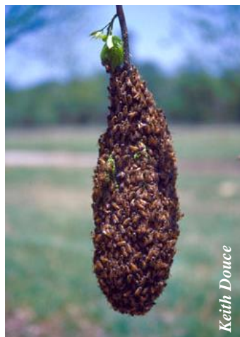
Figure 6. Swarm on a branch

Once a swarm finds a suitable home site, they start to build comb and rear brood. Problems arise when they establish a colony in a place where they pose a risk to