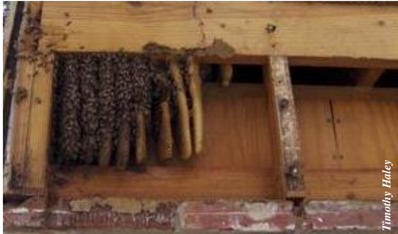
Figure 9. Honey bees established inside the siding of a home, after entering through a crack in the wall

people (Fig. 9). In this situation, bees can become pests because of sting incidents, defensive bee attacks, and the structural damage and annoyance that their foraging and nest-building activities can cause. The chances of people getting stung in such situations are much higher once brood are being reared. Most honey bees observed in the landscape are foraging bees from established colonies looking for water, nectar or other sugary, sweet-smelling substances. But if you see multiple bees passing in and out of a cavity, this indicates the presence of a colony within.