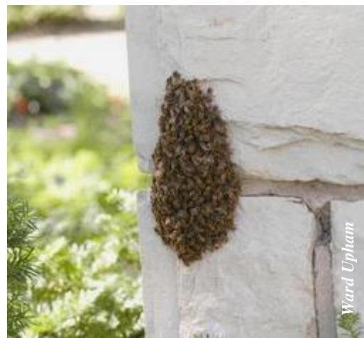
Figure 7. Swarm on a building