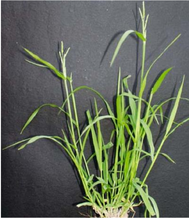
Figure 1. Southwest cupgrass. Oklahoma State University.

Summer annual grassy weeds include (at low desert locations) southwest cupgrass (Figure 1), liverseedgrass (Figure 2), stinkgrass, goosegrass (Figure 3) and sometimes crabgrass (Figure 4). At higher elevation locations crabgrass is a major summer annual grass weed. The above active ingredients are predominately active against grassy weeds.