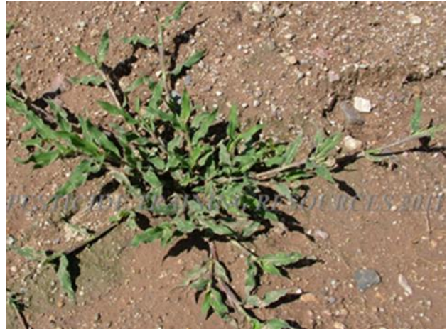
Figure 2. Liverseedgrass.