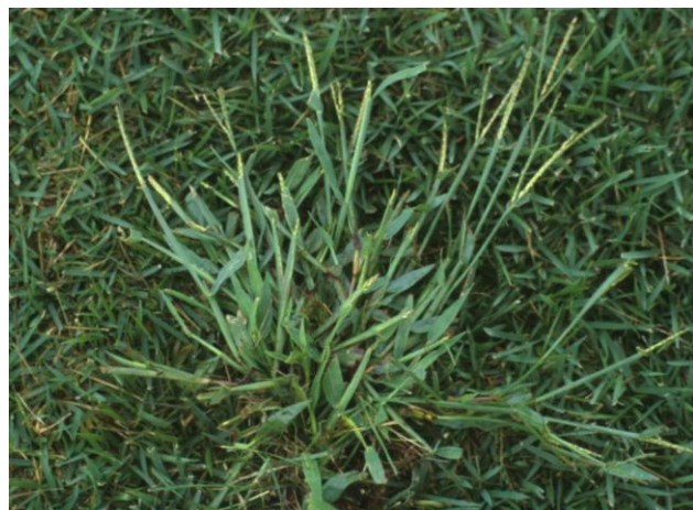
Figure 4. Crabgrass.