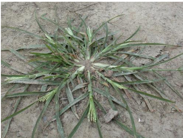
Figure 3. Goosegrass. Extesion.umass.edu