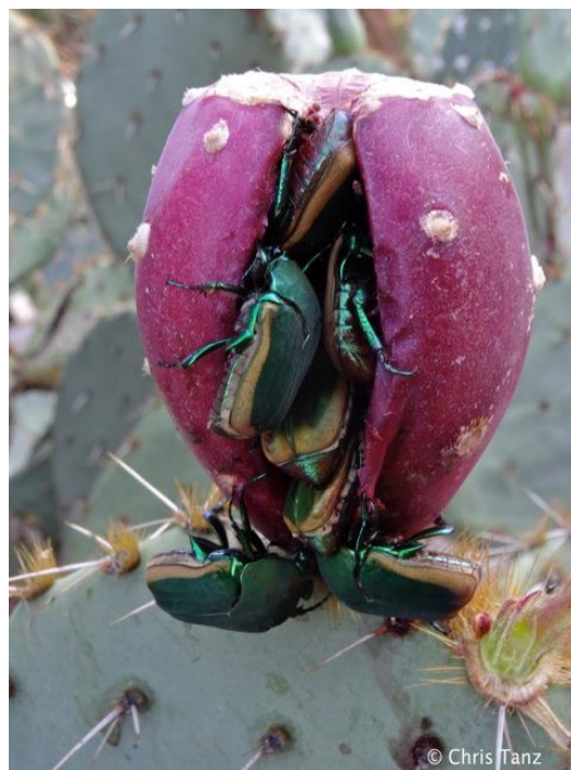
Fig beetles on the red fruit of the prickly pear.

Management recommendations: We suggest you simply enjoy these creatures, but if you absolutely cannot tolerate the beautiful green giants, remove leaf litter and other organic matter from the soil surface in spring to starve larvae. Also, allow the soil surface to dry out and harden to imprison the adults before they emerge. Flood irrigate to destroy eggs and young larvae; they cannot tolerate saturated soil for over 2 days. No chemical controls are recommended.