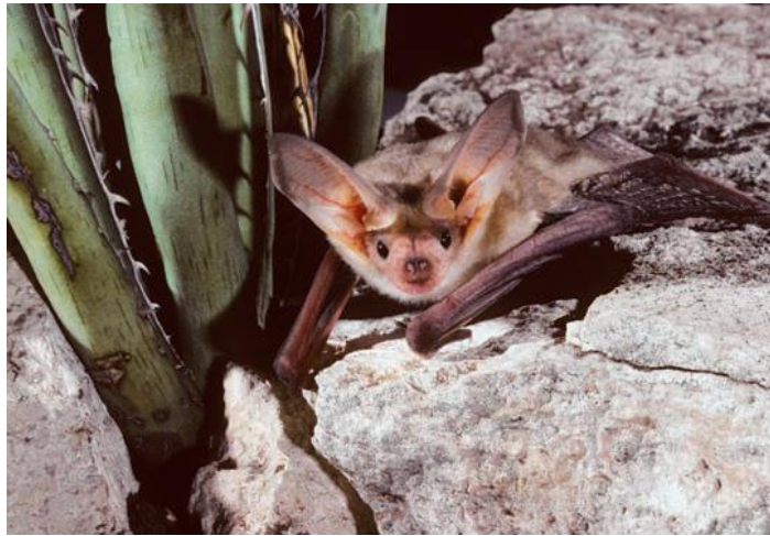
Antrozous, pallidus , pallid bat. A pallid bat is perched on a rock.

Children need to be shown what a real bat looks like, since most people have only seen bats either in cartoons or flying in the air from a distance at dusk. When a bat is on the ground, it is difficult for both children and adults to recognize it as a bat, because the wings may be folded inward. Children should be taught to not touch a bat and to immediately tell an adult. Adults must learn the safe way of capturing a bat.