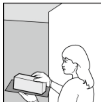
Capturing a bat indoors can be as simple as "boxing a bat".