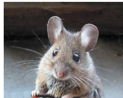
The adult house mouse.maine.gov

The house mouse is one of the most troublesome and economically important rodents in the United States. They feed on human food and contaminate food with droppings and urine. They cause structural damage to buildings by building nests and gnawing; they chew on furniture and electrical wires. In addition, house mice can spread disease transmitting pathogens or parasites to humans and pets, including salmonellosis (food poisoning), ringworm, mites, tapeworm and ticks. They generate allergens, which are asthma triggers and should not be tolerated inside schools. Effective, low hazard options to eliminate these pest mice are available and have been presented in previous newsletter. Here we address the use of rodenticides in schools.